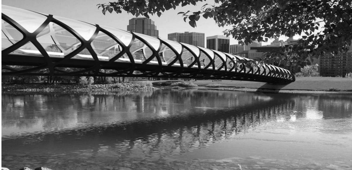
The Peace Bridge

In September of 2008 Calgary City Council approved the construction of a pedestrian bridge over the Bow River west of Prince's Island Park. The location of the bridge is designed to create a convenient link for users of Calgary's pathway system and pedestrians wishing to travel between the Sunnyside LRT Station and central downtown destinations. The bridge was designed by award-winning and world renowned architect and bridge designer Santiago Calatrava and is estimated to cost a total of over $20 million dollars. Currently, the bridge is 10 months behind schedule and planned to be completed by June of 2011. During the delay, the "Peace Bridge" has become an increasingly divisive issue amongst Calgarians. Many believe that the bridge could have been constructed for far less than its staggering $20 million dollar price tag while others believe that there are more important issues for the city to tackle. Collectively, those in disagreement are unified under the belief that the bridge is nothing more than a symbol of unnecessary and irresponsible public spending. However, there are many others who see the construction of the bridge, and its price tag as necessary, citing that world class architecture is just one step Calgary must take to attract attention and become the "global city" it has for so long aimed at becoming.