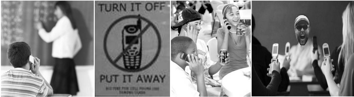
Cellphones in the Classroom

Unquestionably one of the most controversial issues amongst students is the restriction of cellphone use in school. Alongside cellphones, students are often restricted in their use of MP3 players or handheld gaming devices while in school. Just as they are while driving, cellphones are often a distraction to their user – especially when they are supposed to be paying attention to something more important than texting their friends. There are several assertions to the positive role cellphones can play inside the classroom, however many of these assertions are unfounded and untrue. Cellphone use in schools can be linked to reduced performance, lessened attention span, cheating, and bullying. Still, students continue to use their electronic devices despite the fact they have been told not to.